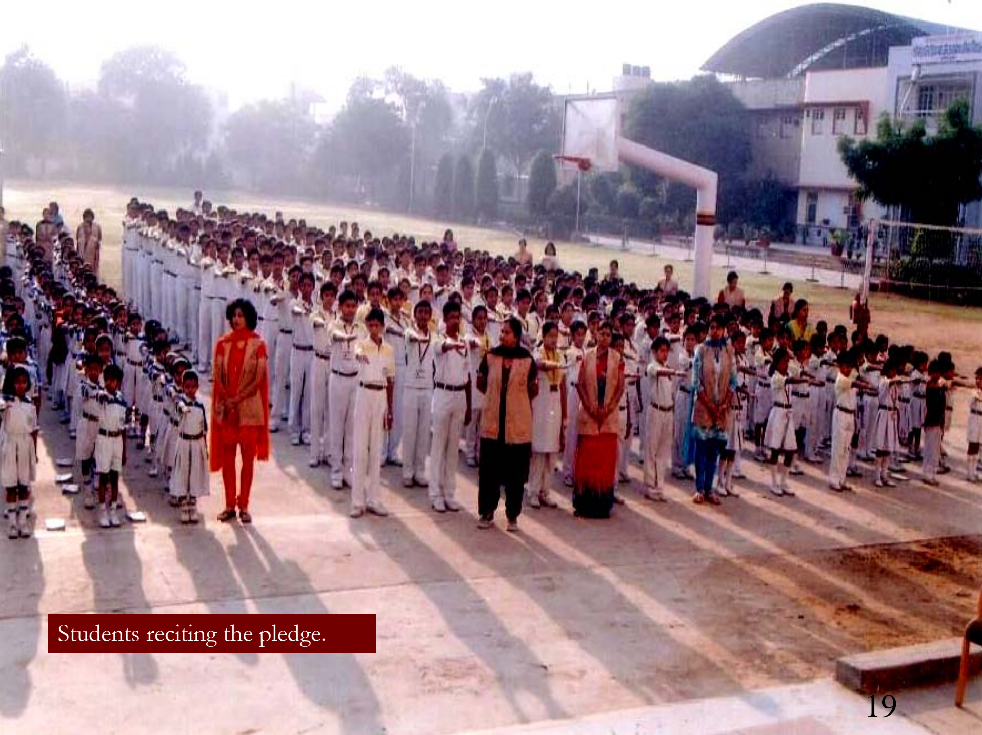
Students reciting the pledge.