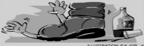
ILLUSTRATION: P.K. JOB

The court reserved its order on framing of further guidelines to curb ragging incidents and asked the amicus curiae and the counsel for Andhra Pradesh and Himachal Pradesh to study the report of the sub-committee and come out with more suggestions.